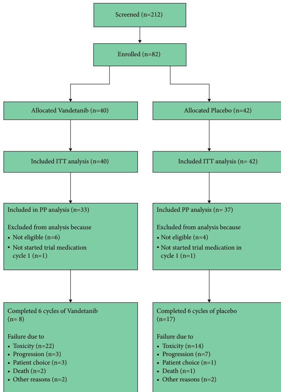
Fig. 1 CONSORT flow diagram of trial participants.

of vandetanib (Fig. 2B). There was a corresponding absolute reduction of 10.6% in the 1-year OS in the vandetanib arm (54.4% in the vandetanib arm vs 65.0% in the placebo arm) (95% CI 31.2–6.0%).